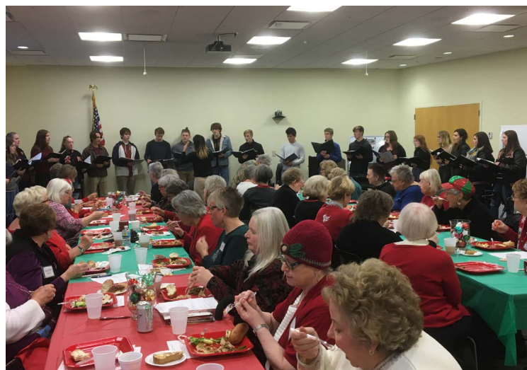
A PCRTA holiday celebration with food and song!

To learn more about the Pickaway Co. chapter, please visit their website or Facebook .